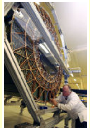
Globus Toolkit components will be used to store and analyze data from the ATLAS experiment.

The Globus Alliance conducts research and development to create fundamental technologies behind grid computing, which lets people share computing power, databases and other on-line tools securely across institutional and geographic boundaries. The Alliance produces open-source software, freely available to all developers, that is central to science and engineering grid activities. Developers of such projects in turn contribute to Toolkit development.